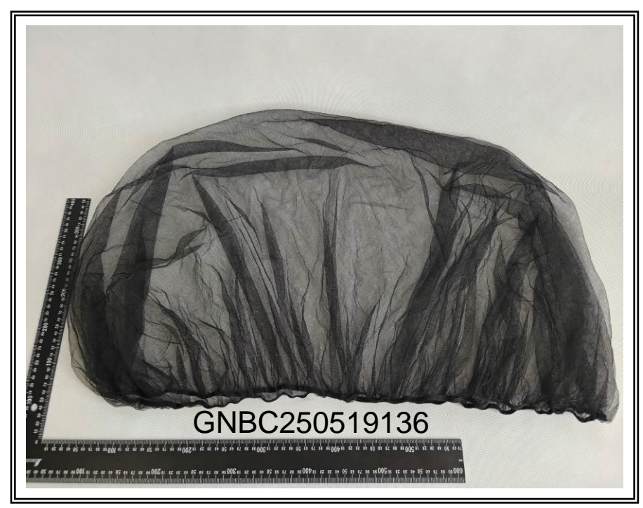
GIG authenticate the photo(s) on original report only